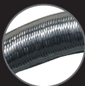
HEAVY-DUTY METAL CABLES WITH WATER-PROOF PROTECTIVE OUTER COATING