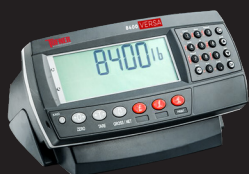
8400 VERSA INDICATOR UPGRADE