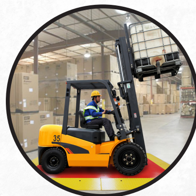
5FT. X 7FT. DECK FITS A STANDARD SIZE FORKLIFT