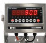
IP65 STAINLESS STEEL