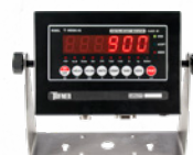
IP65 PAINTED STEEL