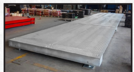
HOT DIPPED GALVANIZED