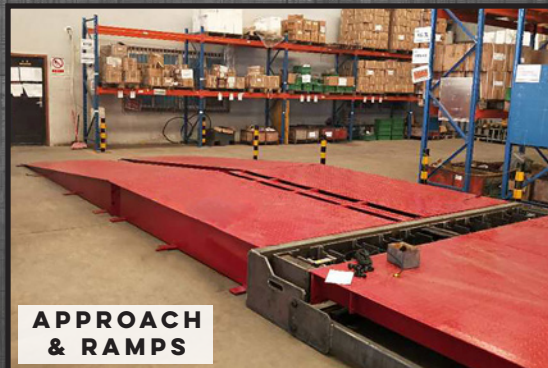
APPROACH & RAMPS