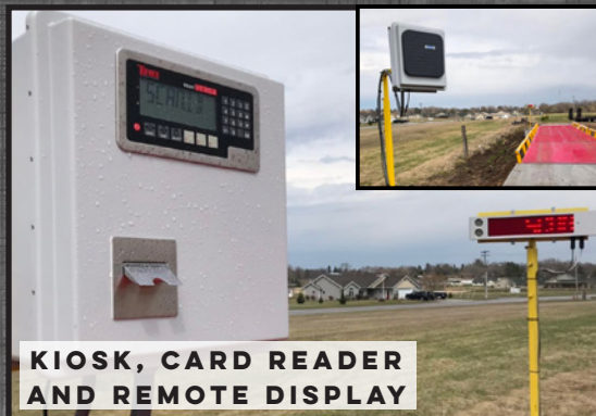
KIOSK, CARD READER AND REMOTE DISPLAY