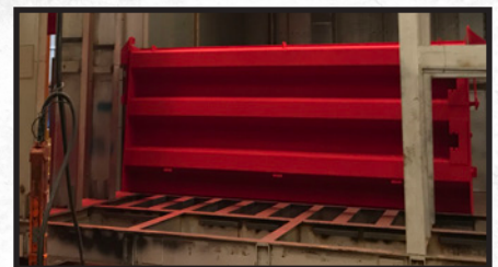
POWDER COAT FINISH