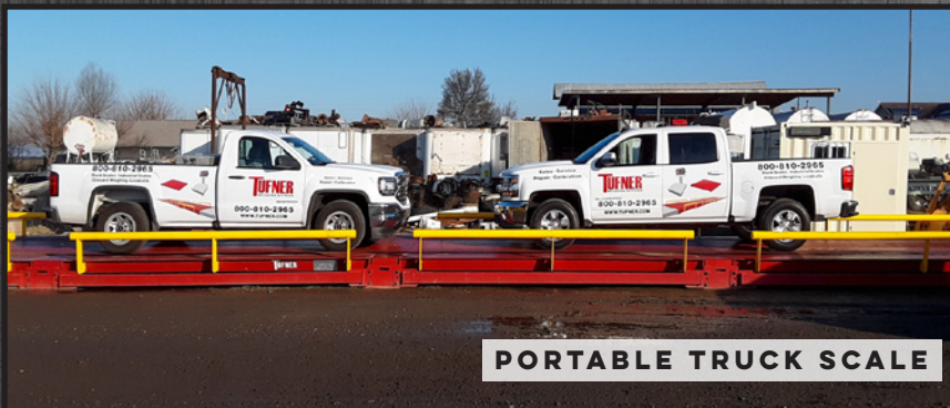
PORTABLE TRUCK SCALE